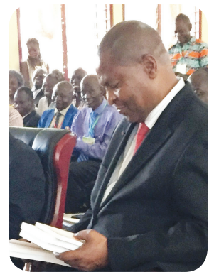
President Touadéra looks over his pack of BLF books.

We hope to bless over 300 mission leaders from all over French-speaking Africa in Abidjan, Côte d’Ivoire this April. Large shipments need to be sent months in advance to ensure they arrive in time. We must ship these books by February 2017.